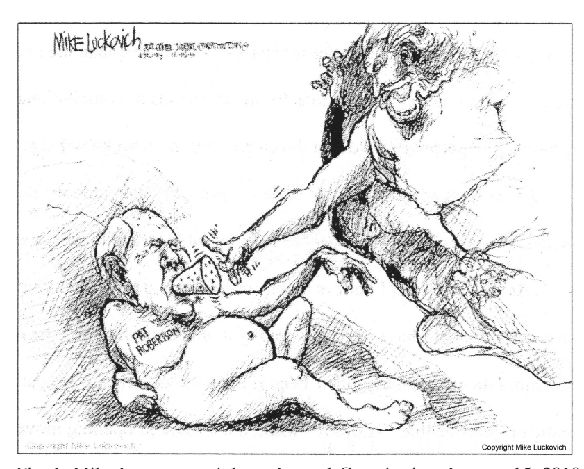
Fig. 1: Mike Luckovich, Atlanta Journal-Constitution, January 15, 2010